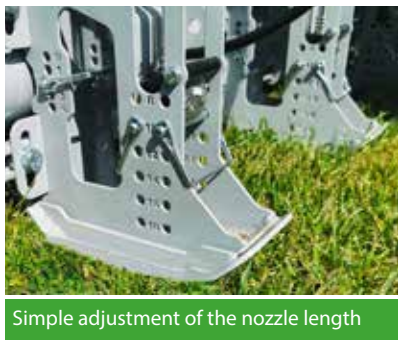
Simple adjustment of the nozzle length

Providing fresh oxygen for all sports and golf, natural and hybrid turf applications